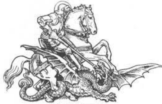
St. George and the Dragon.